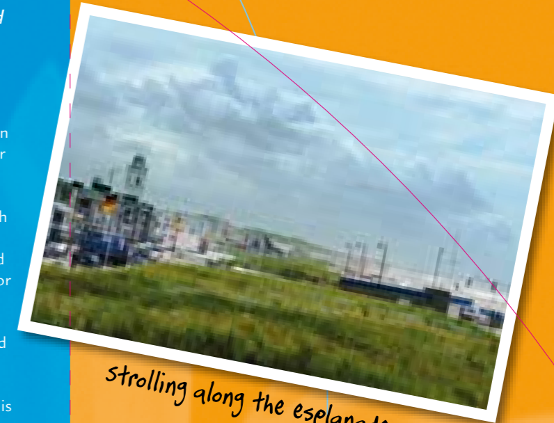
Strolling along the esplanade

Dune House 6 (bungalow for 6 people): in this bungalow the living and the dining areas are separated by means of elegant stairs to the next floor. It has a kitchen with a dishwasher, a large refrigerator/freezer and a microwave oven. The bedroom on the ground floor has two single beds and an extra television. Upstairs are another two bedrooms each with two single beds. A bathroom with a bath, a separate toilet and a storage area is situated downstairs, while there is another bathroom with a shower and toilet upstairs. A terrace area with garden furniture.