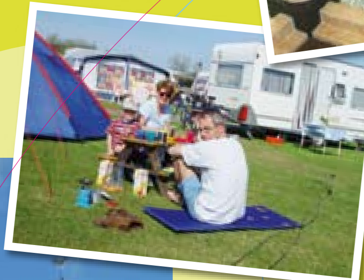
Having a picnic by your tent!

things to do for the older children. Really 'hot' are the public sports field at the entrance to the camping grounds and the super skate park next to the beach entrance. We have an enthusiastic recreation team that will make sure the summer is filled with fun. They organise games, walking tours, sports events and the children's theatre at 'de Burcht'... Who would like to join us?